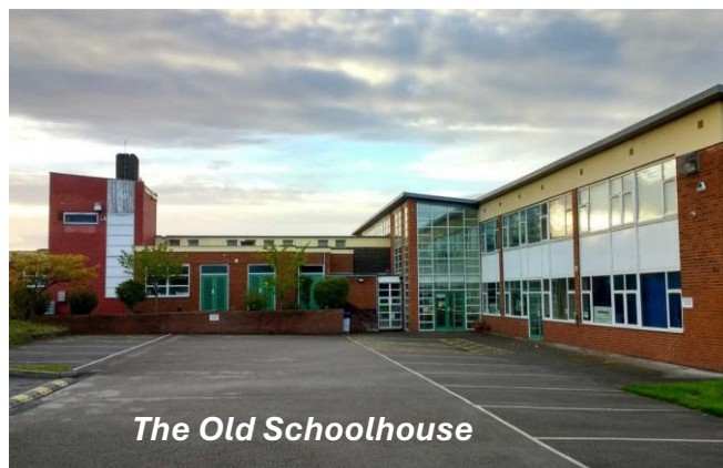
The Old Schoolhouse

Hello and welcome to our spring newsletter, the first of four I hope to produce this year. I will use this format to keep you abreast of the status of the Huyton u3a, the events we have planned, ideas we have and the help we need for the future.